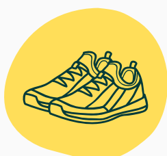
Shoes & Socks