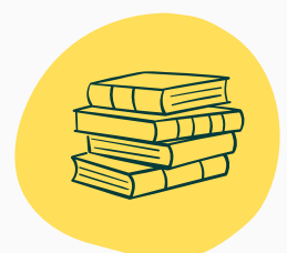
School Exercise Books